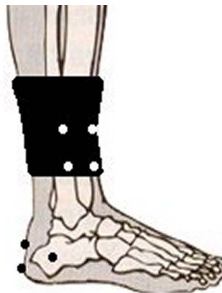
Figure 1. Marker set on the calcaneus and on the tibia shell.

segment was defined by three 6-mm diameter external markers on the calcaneus. Two markers were placed on a line on the posterior aspect of the calcaneus, which bisected the heel in the frontal plane, one marker on the upper ridge and the second on the lower ridge. A third marker was positioned on the lateral aspect of the calcaneus, approximately mid point between markers one and two (McClay and Manal, 1998) (Figure 1). All the foot markers were attached directly to the calcaneus during weight bearing (resting standing) to decrease the error between skin marker and skeletal location (Maslen and Ackland, 1994). Four 1.2-cm diameter reflective markers were attached to the shell similar in position to Manal et al (2000). The first marker was located 30% of the shank length proximal to the lateral malleolus. Then the three markers remaining were positioned with a 20% of the shank length being the vertical and horizontal spacing between the four markers in lateral and anterior positions (Manal et al., 2000) (Figure 1).