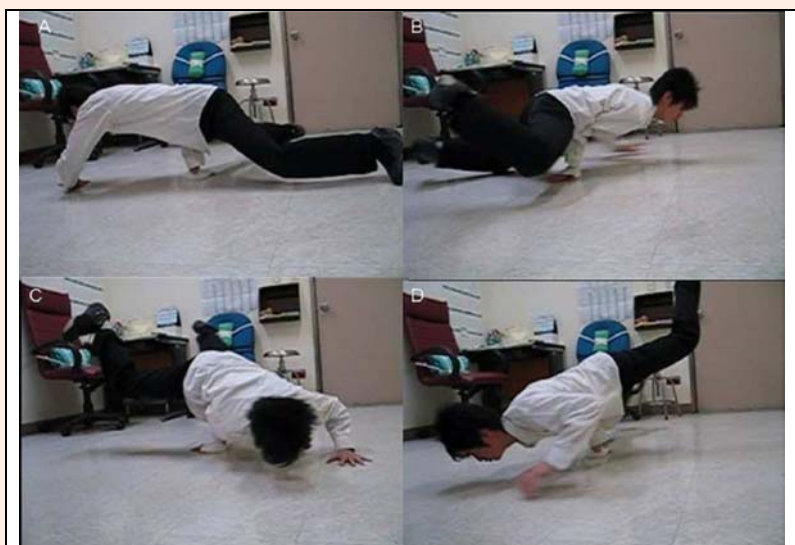
Figure 1. “HAND GLIDE” is a type of spin usually performed while balanced in a one-handed float position.

The clinical history and presentation were strongly suggestive of a stress fracture of the middle third of the ulnar shaft. The patient was advised to restrict both weight bearing and rotational physical activities of the right forearm. Follow-up radiographs after 3 months